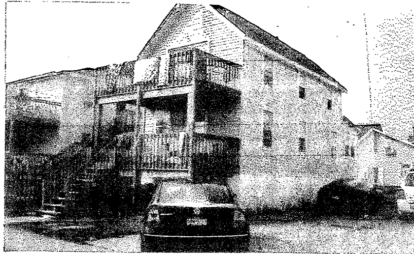
138 39 th St.

NB. You can usually spot a disorderly house by the number of towels hanging over the front railing.